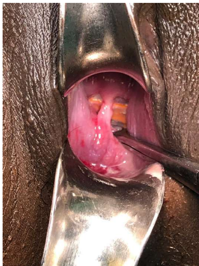
Figure A: Foreign body buried under fibrous tissue.

Evaluation under anaesthesia revealed a foreign body buried under fibrous tissue which was excised (Figure A, B) and a sharpener retrieved (Figure C, D). Steroids, tocolytics and broad-spectrum antibiotics were administered. The postoperative period was uneventful. The pregnancy progressed to term resulting in spontaneous vaginal delivery. A foreign body in the vagina is rarely considered in the differential diagnosis of vaginal discharge in a pregnant woman. Reliable history with thorough examination aids in accurate diagnosis.