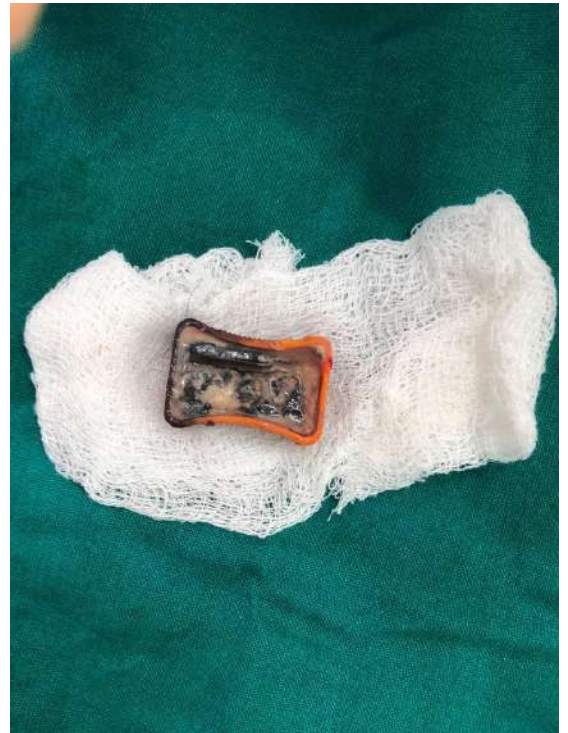
Figure D: Sharpener coated with foul-smelling vaginal discharge.