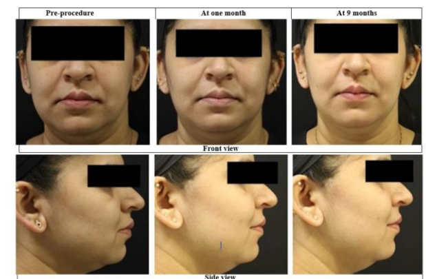
Figure 2: Digital photographs at pre-procedure and at follow-up visits in front and side profiles.