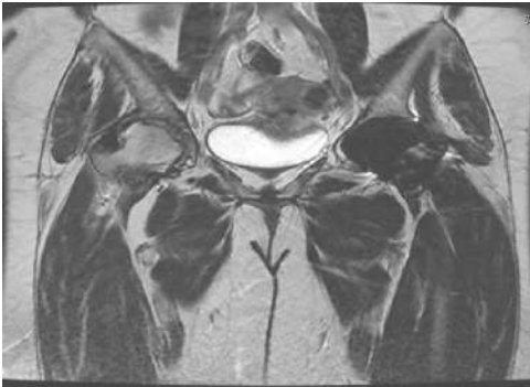
Figure 2b: MRI of the right hip joint 14 months post procedure (February 2022) - As Shown in Fig3a and 3b.