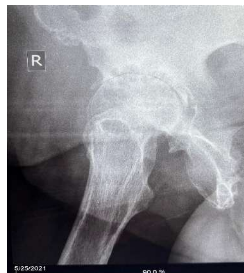
Figure 2a: X-ray of the right hip joint 6months post procedure (May 2021)- As shown in Fig. 2a.

The patient was monitored for any safety events including Adverse Events (AEs) and Severe Adverse Events (SAEs) before, during and after all the procedures. SAEs are defined as any fatal or life-threatening events leading to hospitalizations or requiring major medical interventions. Baseline parameters collected included blood work, radiographic imaging, vitals (blood pressure, pulse, temperature, respiratory rate). Radiographic imaging was done at 6 months, 12 months and 24-months post procedure (Figure 2-4).