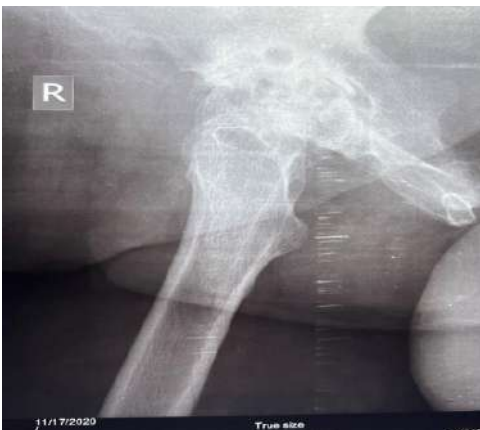
Figure 1b: X-ray of the right hip joint (November2020)- showed features of degenerative changes.