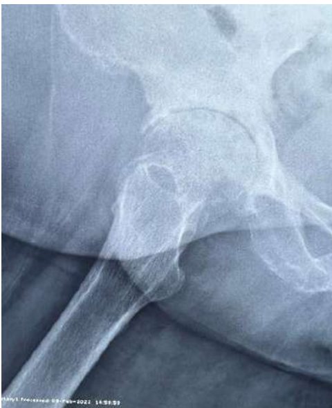
Figure 3a: X-ray of right hip joint 14 months post procedure (February 2022)

THERE WAS A COMPARISON WITH THE 1ST MRI DONE IN 17/11/2020 AND THERE WAS NO DISEASE PROGRESSION NOTED.