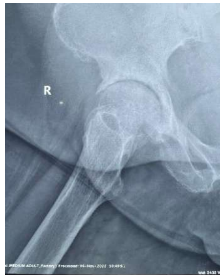
Figure 4b: X-ray of the right hip joint 24 months after the procedure (November 2022).